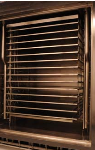
Jubilant HollisterStier's newly-installed 385 ft 2 lyo loading system